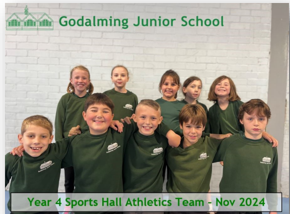
Year 4 Sports Hall Athletics Team - Nov 2024

Well done to our Year 4 squad who took part in the sports hall athletics festival at Broadwater this week and got a taste of the different type of events on offer should they be interested in trying out for the upper school squad next year!