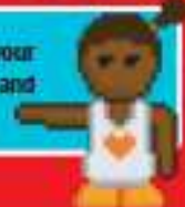
Illustration: © Childnet

Visit Childnet's Kidsmart website to play interactive games and test your online safety knowledge. You can also share your favourite websites and online safety tips by Joining Hands with people all around the world.